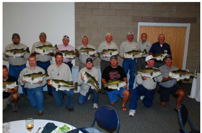
This year's ShareLunker entrants and their replicas

The Toyota ShareLunker Program is made possible by a grant to the Texas Parks & Wildlife Foundation from Gulf States Toyota. Toyota is a long-time supporter of the Foundation and Texas Parks and Wildlife Department, providing major funding for a wide variety of education, fish, parks and wildlife projects.